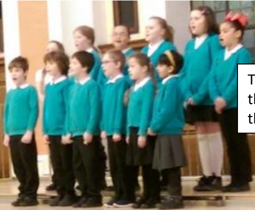
The school Choir perform regularly throughout the year in venues such as the Town Hall.