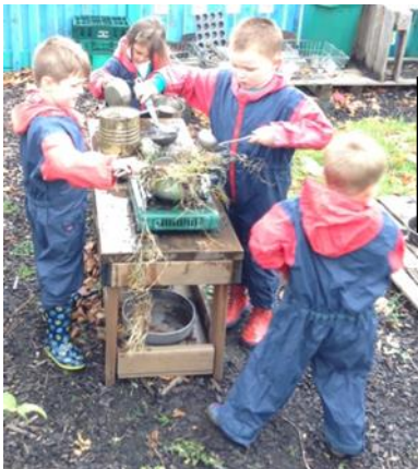
The Early Years children enjoy learning outdoors in a high quality environment.