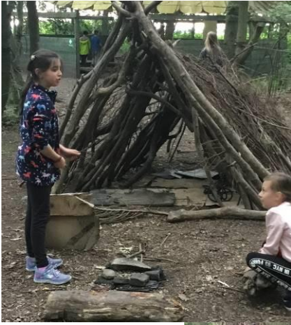
Children in Key Stage 2 at the annual residential trip.